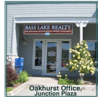
Oakhurst Office, Junction Plaza

providing our sellers with even greater visibility and accessibility.