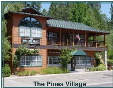
The Pines Village

Bass Lake Realty has recently contracted with Touch Point Systems to provide a new illuminated display in the front windows of the Bass Lake office in the Pines Village.