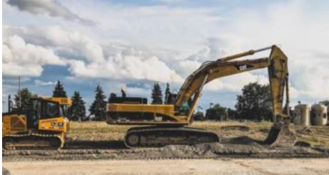
A large construction project is coming to the Bass Lake area. Please exercise patience, use caution, and drive safely around the work zones as the work is being completed.

BASS LAKE — Work on the Madera County Roads Hazard Abatement Stewardship Project is set to begin in mid-July. Work will occur throughout the rest of 2022 as weather and conditions allow. There will be hand crews and mechanical teams working on roads near Bass Lake.